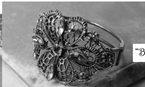
"Kalzidoscope" Bracelet- $40.00