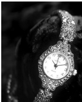
Marcasite Watch $35.00