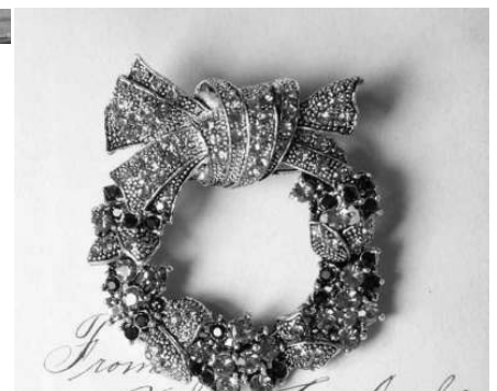
Marcasite Wreath Pin - $35.00