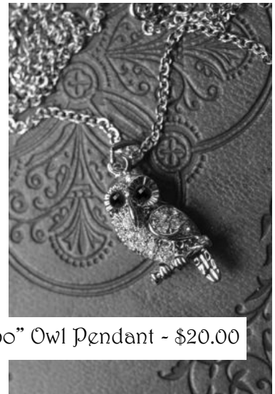
"Bubo" Owl Pendant - $20.00