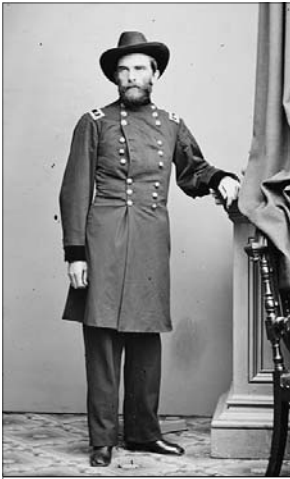
Grenville Dodge circa 1865