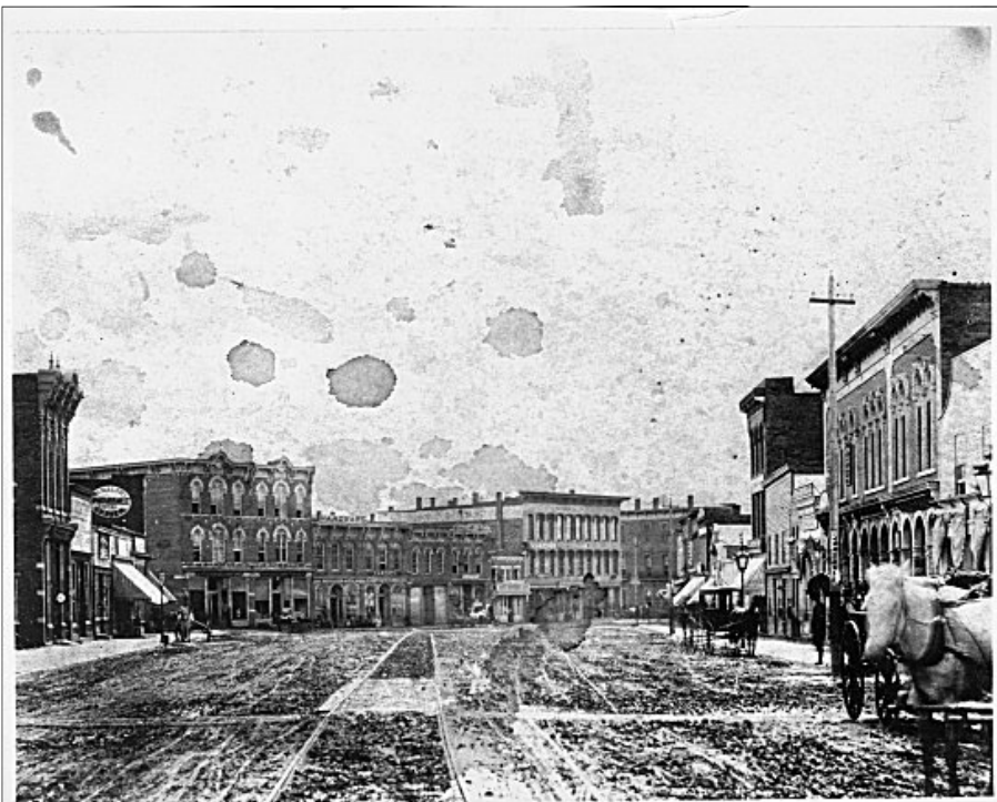
Broadway and 4th Street 1870 Council Bluffs, IA